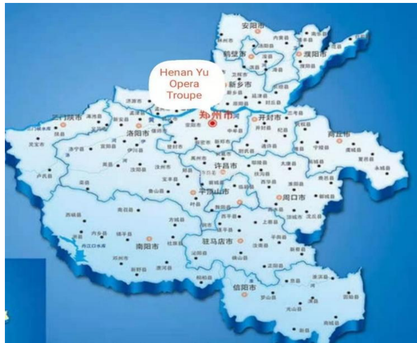
Figure 2 Map of Zhengzhou, Henan, China