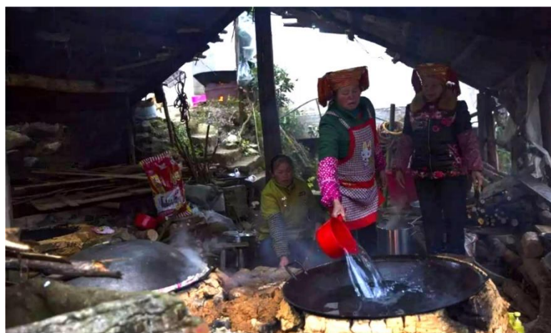
Figure 7 The bride's family is preparing food

On that day, there were so many friends and relatives who came to congratulate the bride. Therefore, the bride's family needed to prepare food to serve them for a whole day from early morning.