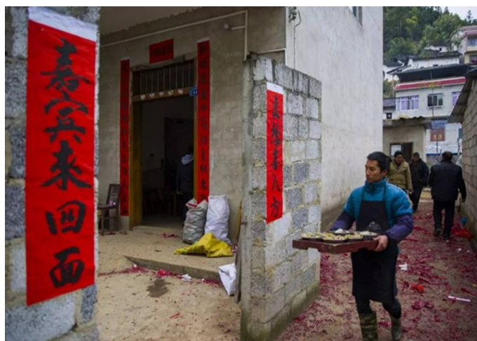
Figure 5 Red banners are affixed to the bride's home

At 7 or 8 o'clock in the morning, firecrackers are lit in the bride's house. The crackling sound of firecrackers, confetti, all kinds of red-colored decoration indicate a jubilant atmosphere. The front door of the bride's home is pasted with traditional red banners with written couplets, which expresses good wishes to the new family.