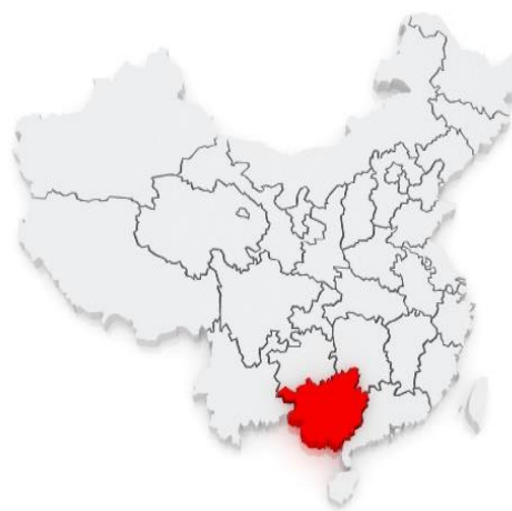
Figure 1 Map of Guangxi Province, China

The Jinxiu Yao Autonomous County is part of Laibin city, Guangxi Zhuang Autonomous Region, and is located in the east of the central part of Guangxi Zhuang Autonomous Region. It is connected to Mengshan County in the east, Pingnan County, Guiping City and Wuxuan County in the south, Xiangzhou County in the west, and Luzhai County and Lipu City in the north. The autonomous county is 62.4 kilometers from east to west and 93 kilometers from north to south, with a total area of 2,518 square kilometers. The Jinxiu Yao Autonomous County is surrounded by the DaYaoShan mountains, except for the northeastern margin of SanJiang township in the north, which is the border of the Jiaqiao ridge. The mountain area accounts for 73% of the county's total land area. The whole terrain is high in the middle, low on all sides, and surrounded by hills, terraces and small plains in the middle. (Website of Jinxiu Municipal People's Government, 2020)