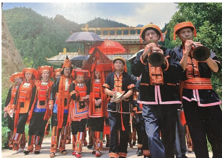
Figure 19 Musicians perform at the village ceremony procession.