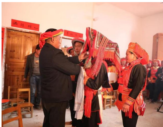
Figure 14 The blessing of elders to the new couple

before, but the whole wedding ceremony is still very splendid.