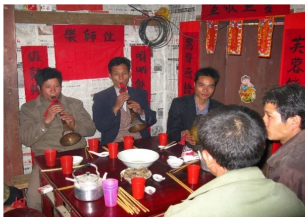
Figure 20 The musicians perform inside the house

The seating performance is held during the formal wedding ceremony and banquets. The suona players sit around a square table arranged by the host for playing, leading the progress of the wedding ceremony.