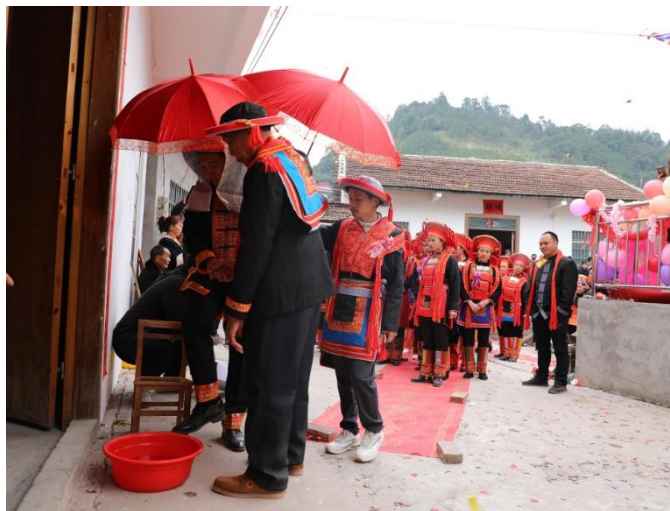
Figure 11 The groom's foot washing ceremony before entering, and then put on the new shoes.