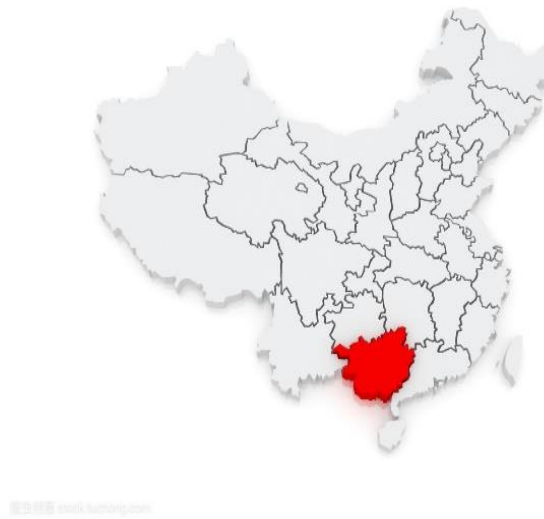
Figure 2 Map of Guangxi Province, China