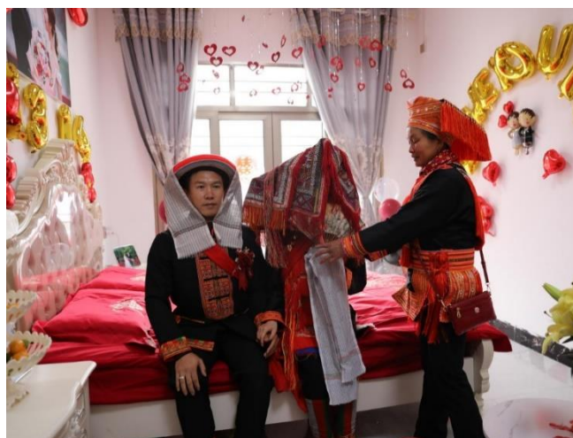
Figure 12 The bride's family is helping the groom put on new clothes