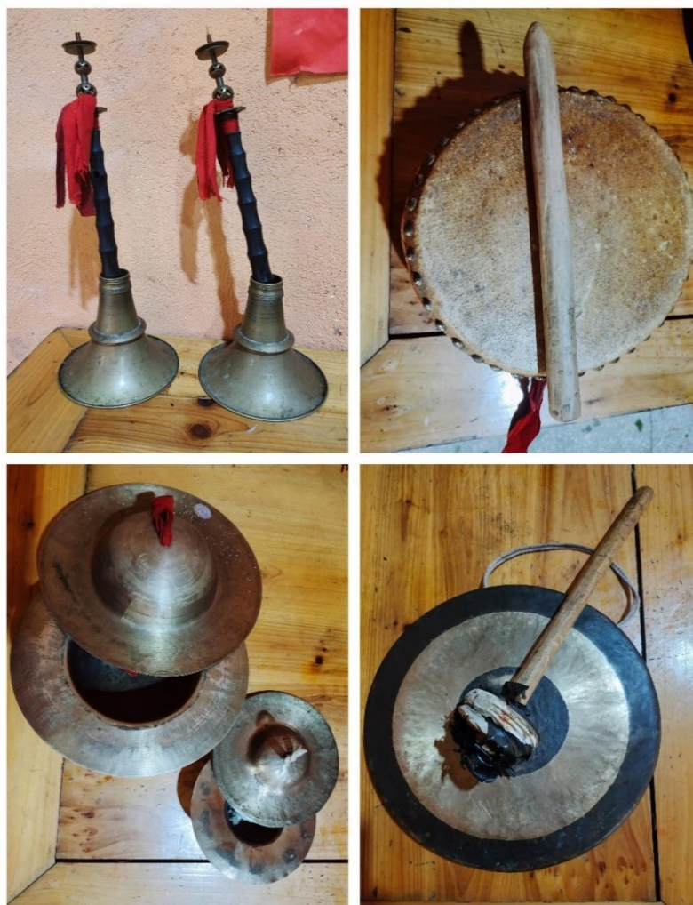
Figure 17 The musical instruments are from Top to bottom, suona (唢呐), drum(鼓), small cymbal(小镲) and big cymbal (大镲), and gong(锣)