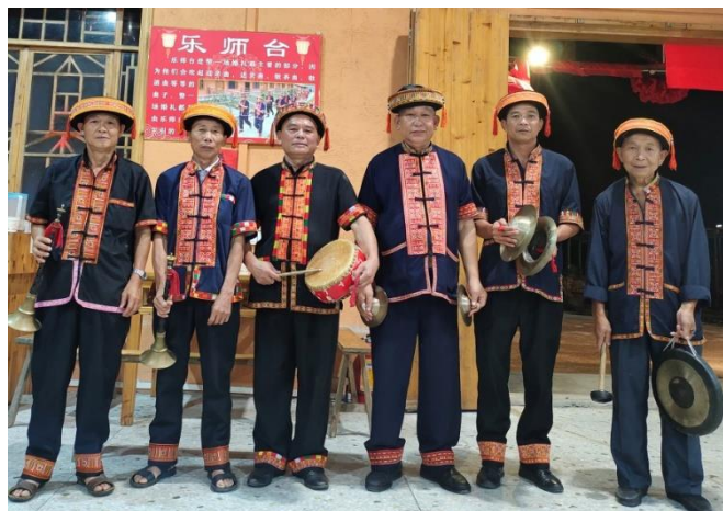
Figure 18 The musicians of the suona ensemble and their instruments