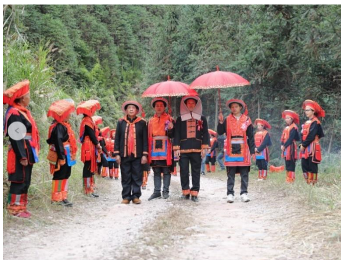
Figure 8 The groom is waiting for the arrival of the procession of the bride's family

In the old days, the groom's house was so far apart from the bride's, the groom had to set off at midnight to ensure punctual arrival. Nowadays, with the convenience of transportation, the groom just need to arrive at a little bit earlier before the appointed time. During the whole process, there will be a person holding a red umbrella for the groom, which indicates fending off disaster and ushering in more prosperous life.