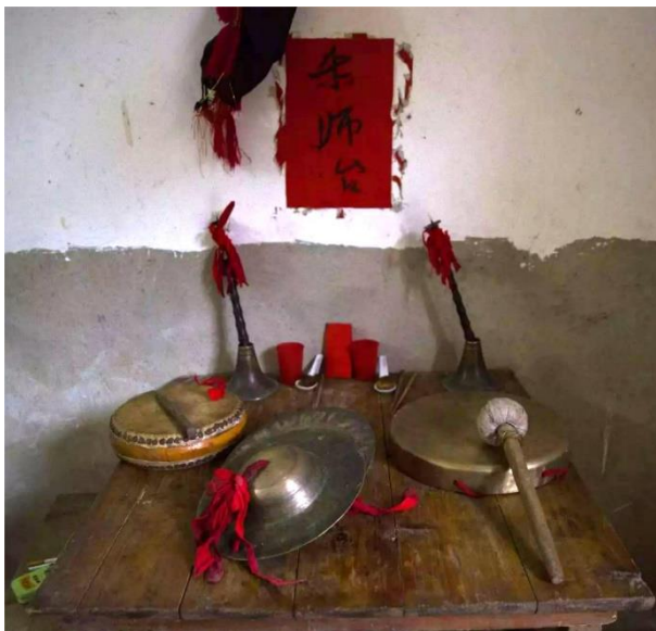
Figure 6 The musicians table prepared by the bride's family for the suona ensemble