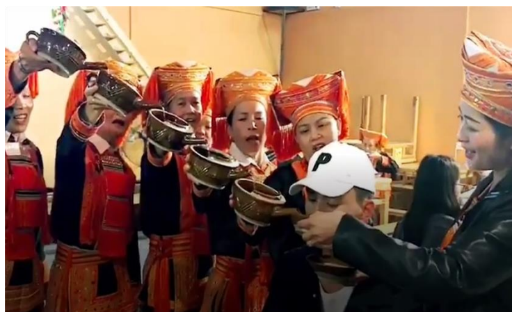
Figure 16 Make a toast and sing a toast song

When toasting, Yao people will sing a toasting song. In the past, the toasting songs were sung in Yao dialect, but now fewer and fewer young people can speak Yao dialect. Gradually, they sing toasting songs in mandarin rather than in Yao dialect. What a pity it is!