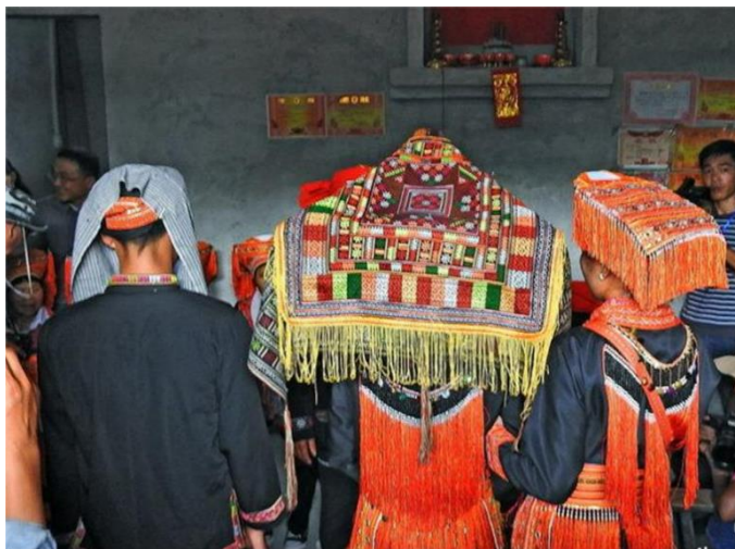
Figure 13 Meeting the bride ceremony