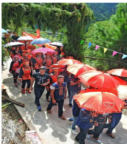
Figure 10 Taking the groom back to the bride's house

After some ceremonies, the bride's family welcomed the groom into their home.