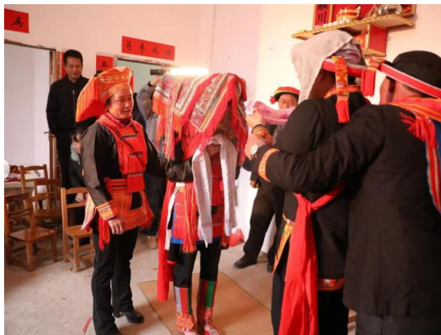
Figure 15 The bride and groom bowed to each other