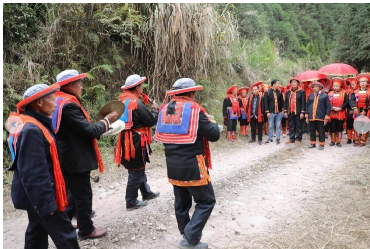
Figure 9 The suona ensemble takes the groom home

which roughly means to thank the groom's family for their hard journey, and wish the groom a better life in the future as well.