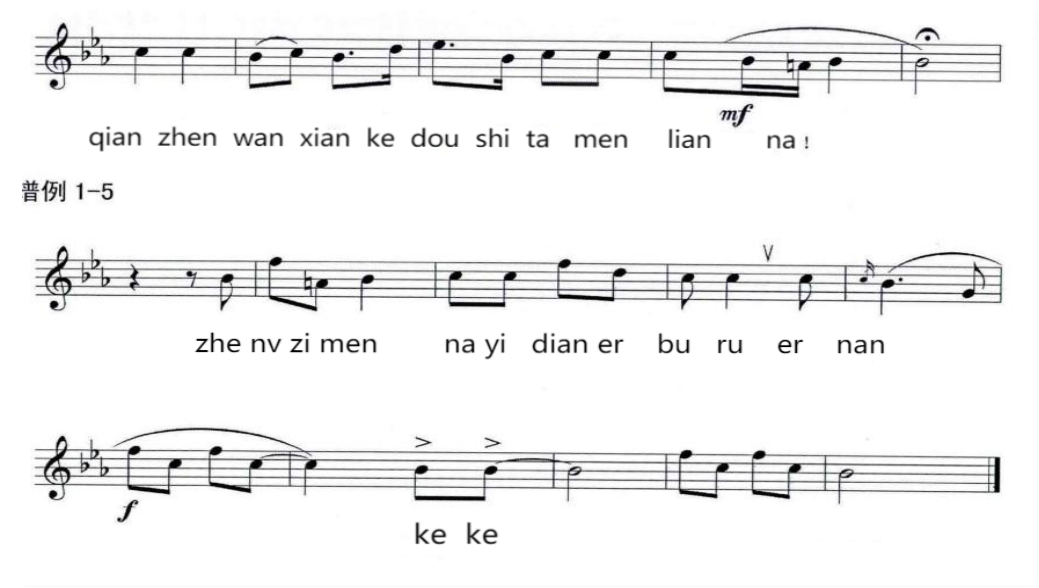
Figure 6 is an excerpt from "Mulan"

different, but it is worth noting that every short accompaniment is added to the sentence, and this kind of accompaniment is relatively rare in Henan opera. This processing not only makes the melody more beautiful and smooth but also makes the mood more coherent, making it more convincing, in terms of rhythm. It also formed a sharp contrast, creatively developed the "two-eight board", which played an extremely important role in shaping the masculinity of Hua Mulan.