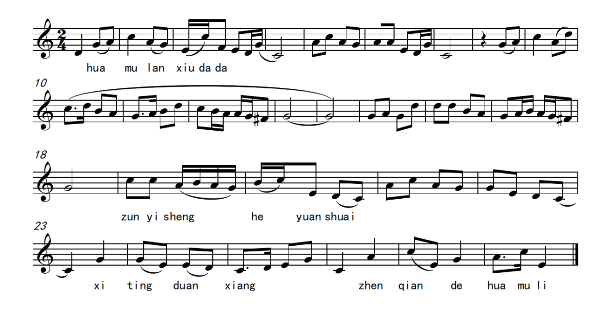
Figure 5 is selected from Henan opera Hua Mulan

5i655321. In Henan opera music, #4 is also an important color tone. It is often used as an auxiliary tone between 5 and 5, between 6 and 5, and between 2 and 5.