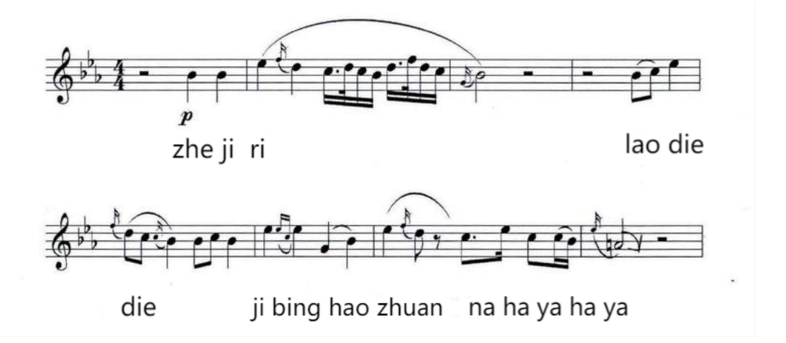
Figure 7 is an excerpt from "Mulan"