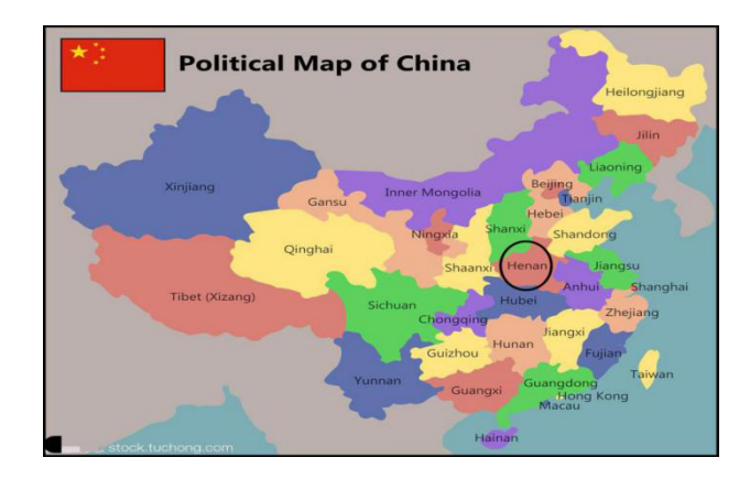
Figure 1 Location

Henan Province referred to as "Yu", is a provincial administrative region of the People's Republic of China. Zhengzhou, the provincial capital, is located in central China. Henan is bounded between 31°23'-36°22' north latitude and 110°21'-116°39' east longitude. The terrain of Henan Province is high in the west and low in the east, bordering Anhui and Shandong in the east, Hebei and Shanxi in the north, Shaanxi in the west, and Hubei in the south.