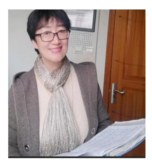
Figure 6

Question 1: Do you have any ideas on how to teach and sing Sichuan folk songs?