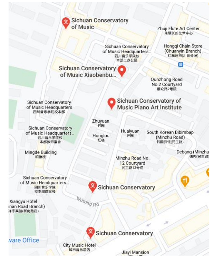
Figure 4 The picture above shows Sichuan Conservatory of Music