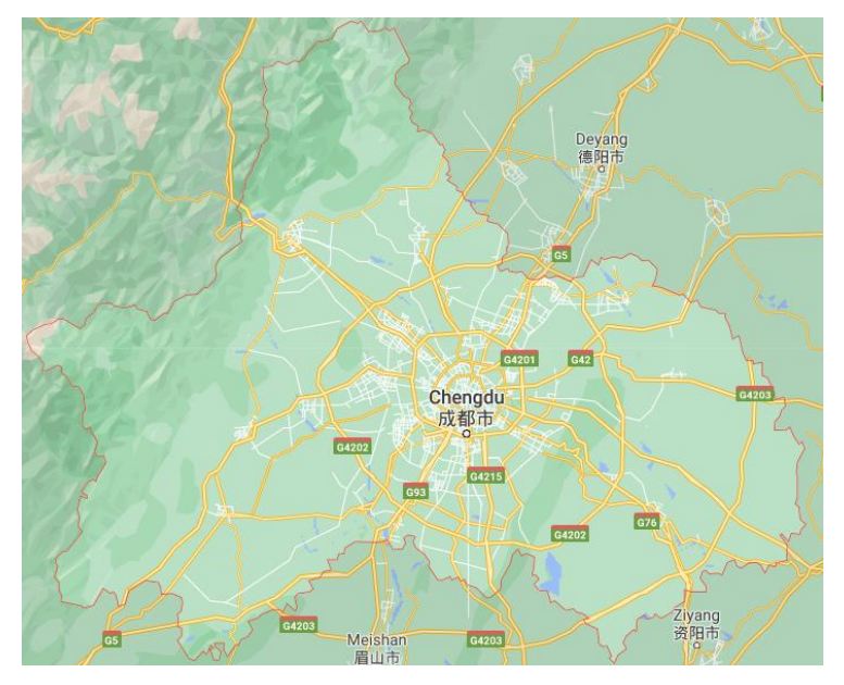
Figure 3 This is a map of ChengDu