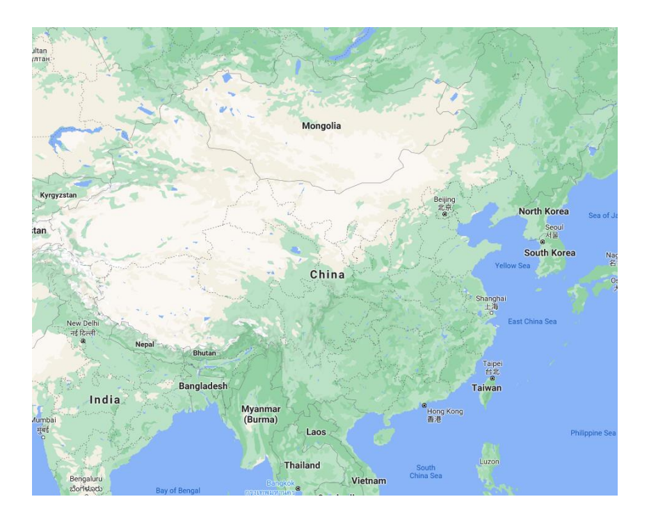
Figure 1 This is a map of China

the qualitative research is based on the "theory with basis". The theory is generated from the interrelationship among different evidence collected, which is a bottom-up process.