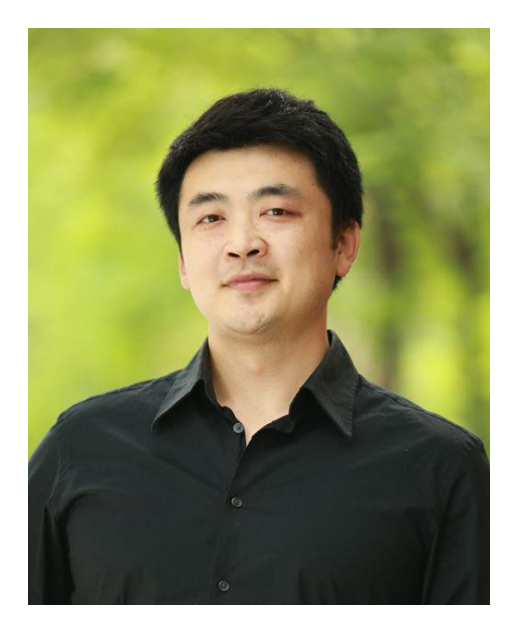
Figure 7

2) Wu Jing: Our Sichuan folk songs generally belong to more high-sounding areas. There are more folk songs, and folk songs are more high-pitched, which is relatively euphemistically low-sounding folk songs. If there are more mid-sound zones, more low-sound zones, and more folk songs combined with high-sound zones, of course, it would be better. After all, we cannot change him but only accept it. In the future, In terms of creation, some adjustments can be made in the style of folk songs.