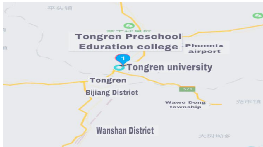
Figure 3 Tongren Preschool Education College