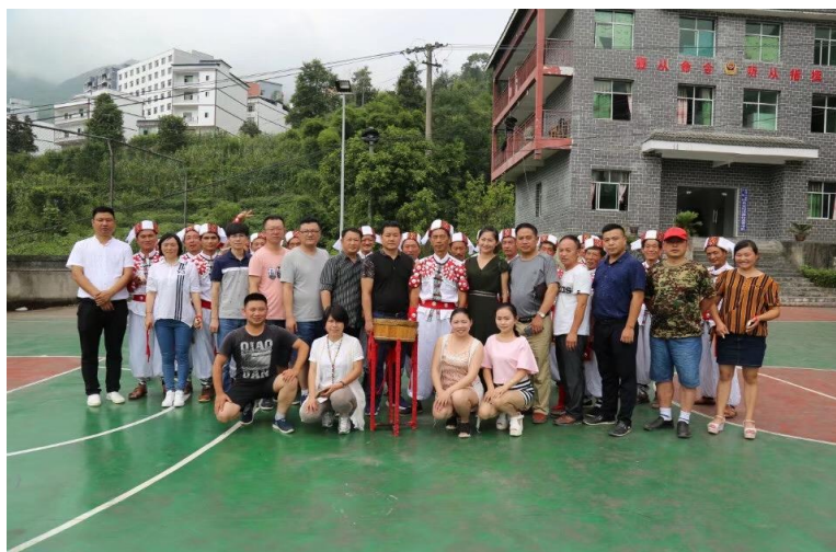
Figure 10 Photographed in Hongdu Town, Yanhe County