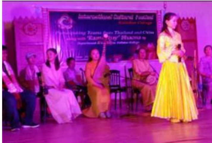
Figure 16 Indian music culture exchange performance