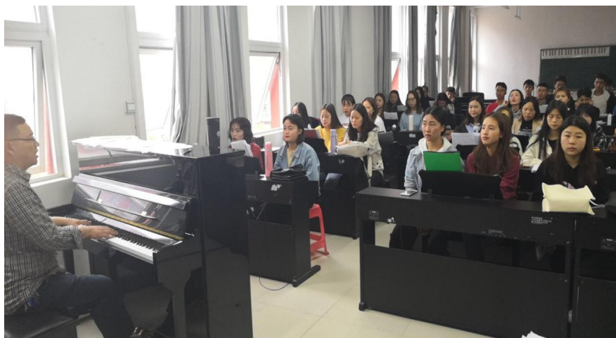
Figure 20 Tujia folk song class