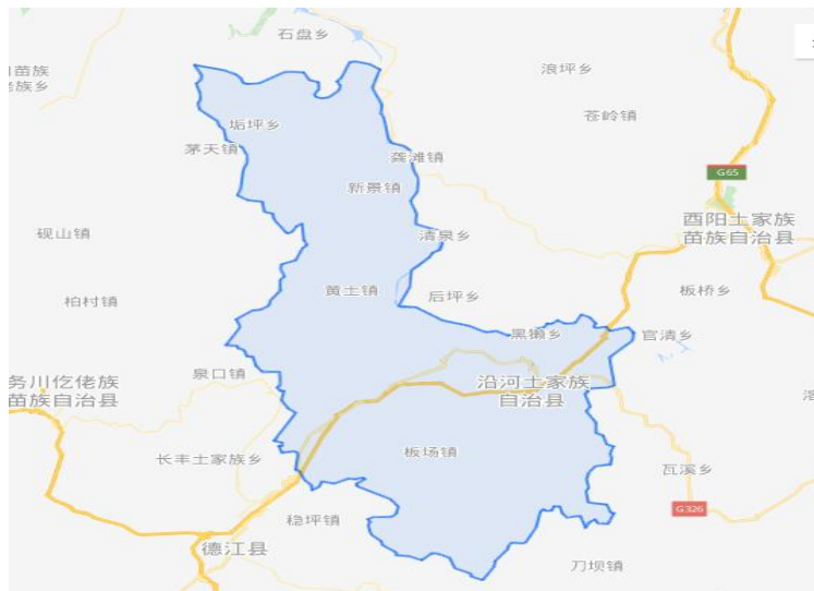
Figure 2 Yanhe Tujia Autonomous County

revolutionary bases in the country. The revolutionary committee of the eastern SAR is the Yunnan-Guizhou Plateau. The first red regime, its former site is a national key cultural relics protection unit. In March 2019, it was selected into the first batch of revolutionary cultural relics protection and use of the film to distinguish the county list.