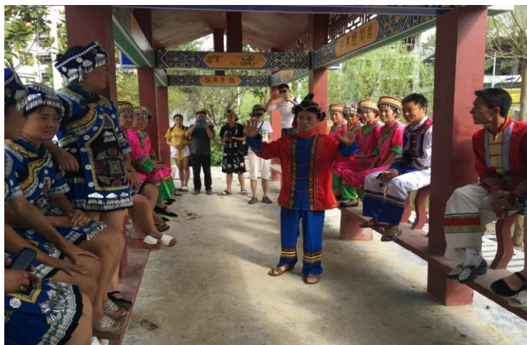
Figure 8 Taken in Banchang Town, Yanhe County

Songs. China" column catalog system, showed Tujia folk songs on CCTV, and successively won the 4th Guizhou Province Minority Art Performance Excellence Award and the first "Colorful Guizhou" singing 30 awards or honors, including the first prize of the Tongren Regional Trial Competition and the Excellence Award of the "Fanjingshan Cup" singing contest finals.