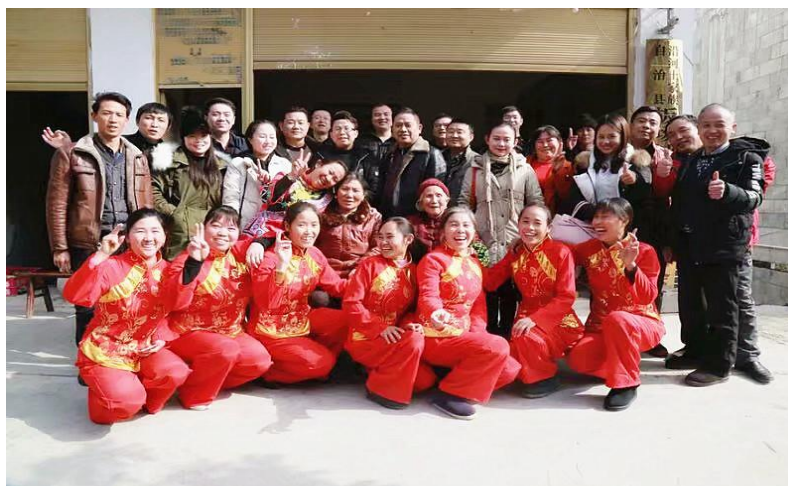
Figure 19 Taken in Banchang Town, Yanhe County