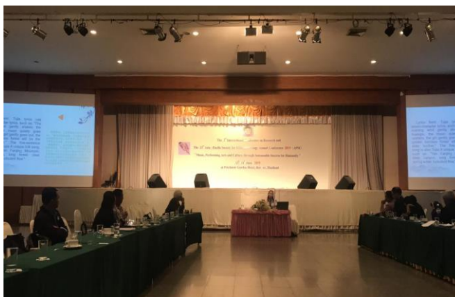
Figure 15 The 23rd Asia Pacific Music Forum International Conference in 2019

Sixth, encourage groups and individuals to display and carry forward Tujia folk songs. In order to better promote and spread Tujia folk songs in my hometown and absorb more performance and teaching experience, I also brought wild horse's original song "Mountain Girl" to the 23rd Asia Pacific Music Forum International Conference in 2019 and Indian music and culture exchange performance during my study in Thailand, which made international friends and exchange teachers and students feel the charm of Tujia folk songs along the river in Guizhou for the first time .