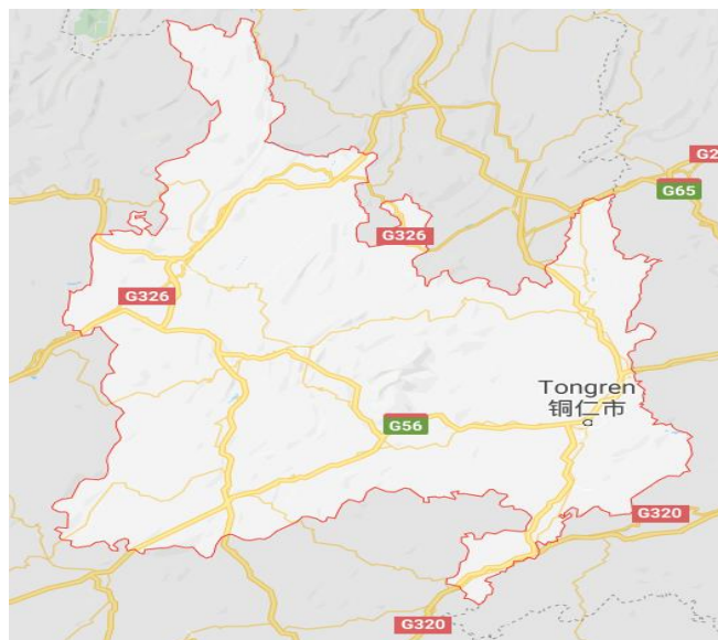
Figure 1 Map of Tongren City, Guizhou Province

geological park. The Shanghai-Kunming Railway, Shanghai-Kunming Expressway, Hangrui Expressway, Tongda Expressway and Sijian Expressway pass through.