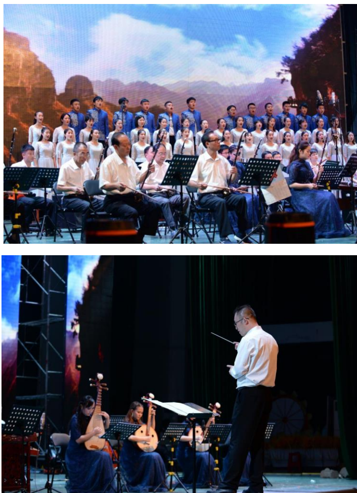
Figure 25 Location: Tongren Junior College