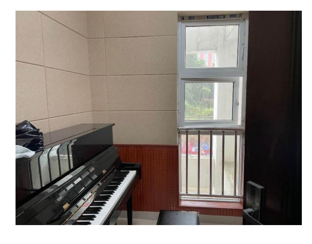
Figure 8 Inside the piano practice classroom

DATE: December 30 2019Inside the piano practice classroom