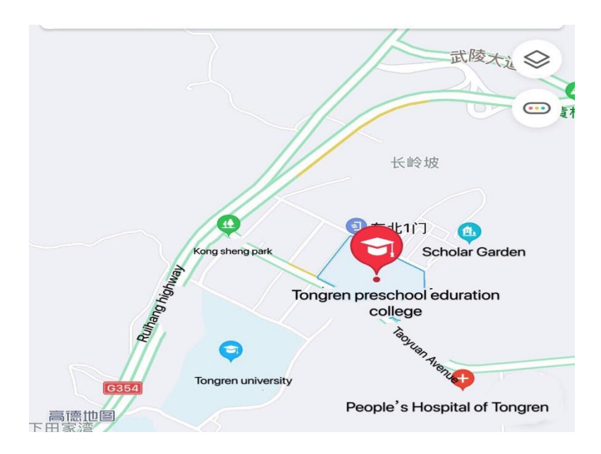
Figure 2 Tongren University Map http://www.gaode.com>maps DATE:November 6, 2020

Tongren University, located in Tongren City, Guizhou Province, is a provincial full-time undergraduate college and the first batch of nation, pilot schools for the reform of agricultural and forestry personnel education and training programs.