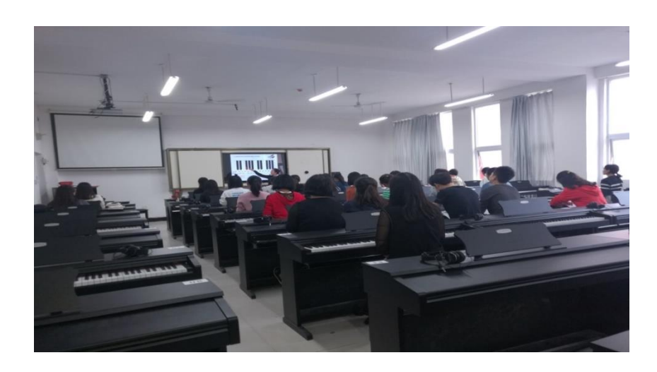
Figure 6 onTongren Preschool Education College Digital piano classroom DATE:December 24, 2019

This photo was taken onTongren Preschool Education College Digital piano classroom