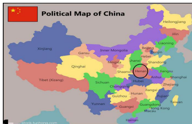
Figure 1 Location

Henan Province referred to as "Yu", is a provincial administrative region of the People's Republic of China. Zhengzhou, the provincial capital, is located in central China. Henan is bounded between 31°23'-36°22' north latitude and 110°21'-116°39' east longitude. The terrain of Henan Province is high in the west and low in the east, bordering Anhui and Shandong in the east, Hebei and Shanxi in the north, Shaanxi in the west, and Hubei in the south.