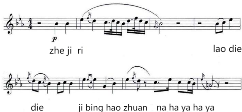
Figure 7 is an excerpt from "Mulan"