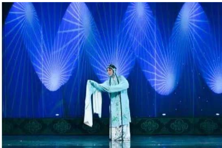
Figure 7. traditional operas of Han Opera in Western Fujian

A large number of ancient Central Plains songs that had been spread among Hakka people were introduced as accompaniment music. At the same time, brother operas such as Gaoqiang, which spread to Western Fujian in the late Ming and early Qing Dynasties, and local folk music materials were absorbed. Through the evolution and integration of modern artists, western Fujian Han Opera was gradually formed.