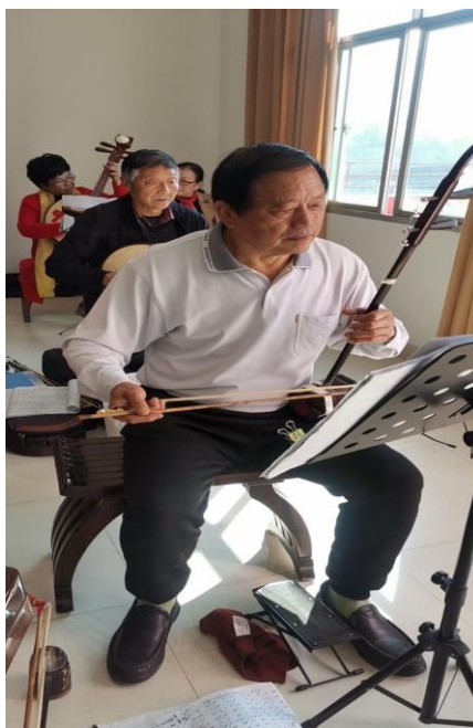
Figure 18. Erhu accompaniment rehearsal photos