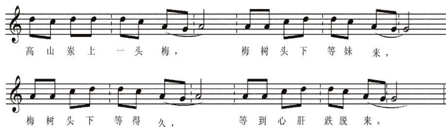
Figure 13. Tanlou

Hongjing's vocals usually use g or F Tune, almost the whole scale in the high range, and sing with the true and false voice, the line also requires smooth, singing is very difficult, its special voice method, makes the "Hongjing" industry on the actor's own conditions are higher, not only to be tall, voice also to be broad and resonant, even so, it is not easy to cultivate. Therefore, in the west of Fujian Province, the story of "thousands of students, thousands of Dan, it's hard to get a clean" spreads. It can be seen that Hongjing actors are precious and rare in the west of Fujian Han Opera. (Chen Hanhuang, 1998)