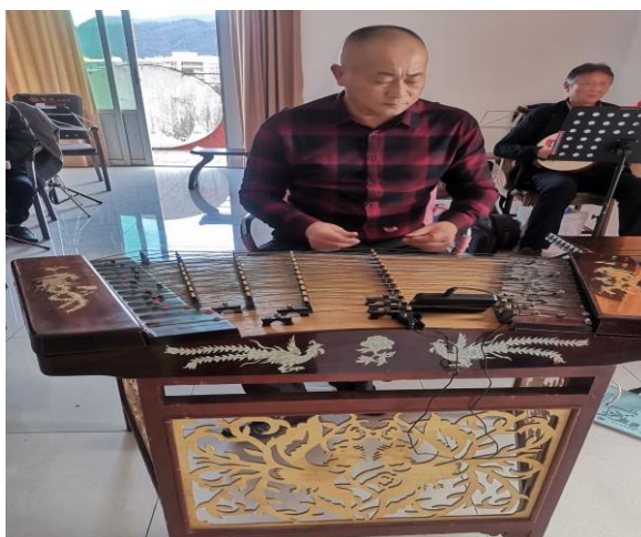
Figure 20. Yangqin accompaniment rehearsal photos