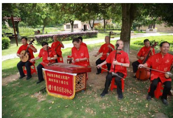
Figure 16. Accompaniment performance photo

Through the field investigation of Western Fujian Han Opera music, it can be seen that the main musical instruments used in Western Fujian Han Opera Music in this historical period are string and plucked instruments.