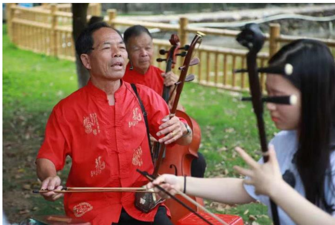
Figure 19. Accompaniment performance photo