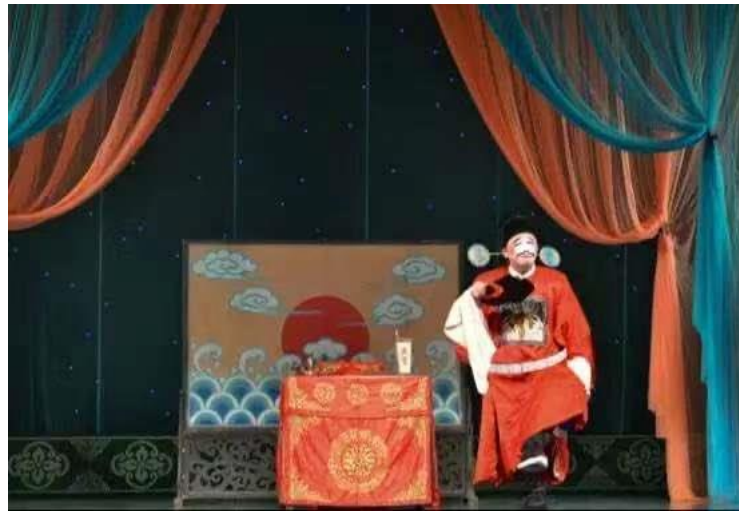
Figure 4. traditional operas of Han Opera in Western Fujian