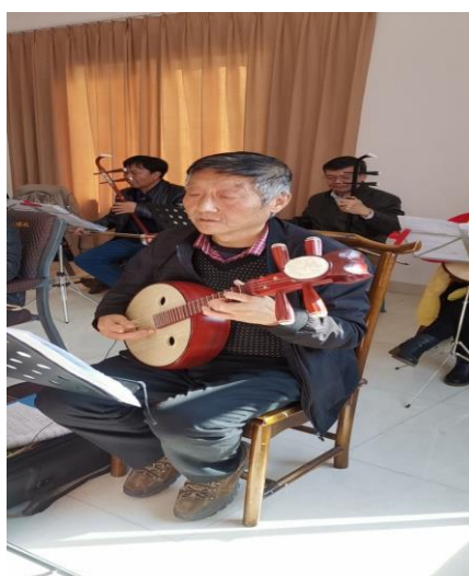
Figure 22. Zhongruan accompaniment rehearsal photos

Yangqin is a commonly used stringed instrument in China. Its timbre has distinct characteristics, large volume, hardness and softness; The timbre is bright and the expressive force is extremely rich. It can be solo, ensemble or accompaniment for Qinshu, rap and opera. It often plays the role of "piano accompaniment" in folk instrumental ensemble and national band. It is an indispensable main musical instrument.