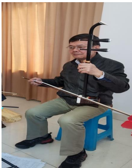
Figure 17. Erhu accompaniment rehearsal photos