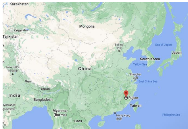
Figure 1. The location in china map