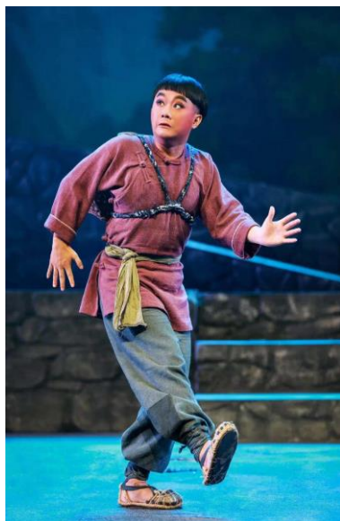
Figure 14. Stills of modern operas of Han Opera in Western Fujian

Because the traditional Western Fujian Han Opera is mostly performed in the wild in mountain villages, in order to make the sound loud and spread far, most of the tune is set too high. In order to make the actors sing naturally and smoothly, the timbre is sweet, and fully mobilize the performance ability of the middle and bass areas, the tune is gradually adjusted to the best sound area of the actors according to 0 plot, so as to achieve the effect of both sound and emotion. Individual plays also use different key duets, or transfer inside the singing, which are a breakthrough in the tradition.