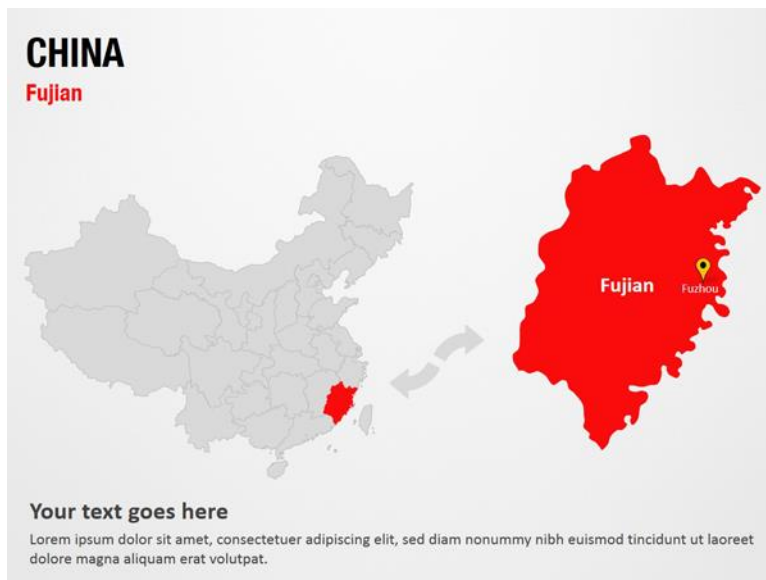
Figure 2. The location in Fujian province map

207489749 MSU iThesis 61012060012 thesis / recv: 15092564 23:36:23 / seq: 11