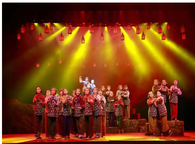
Figure 23. Stills of modern operas of Han Opera in Western Fujian

Since the 1960s, many plays have received great repercussions in the society. Many plays have participated in the provincial opera show and won awards. Some plays have also been made into TV dramas or adapted into TV drama series.