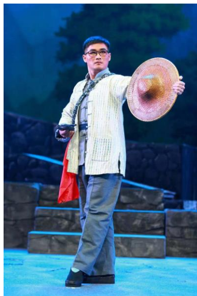
Figure 15. Stills of modern operas of Han Opera in Western Fujian

Qingyi and Huadan also adopts the combination of true voice and false voice to expand their performance range; In order to better express the feelings of the characters, Lao Dan changed to sing high tune and absorbed the melody of "May sixth" tune of Jingqiang, so as to improve its range.