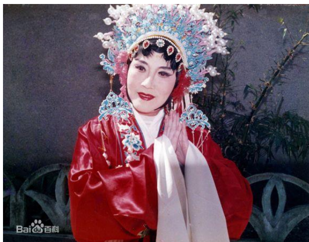
Figure 24. Deng Yuxuan's "golden voice of Han Opera", China drama website