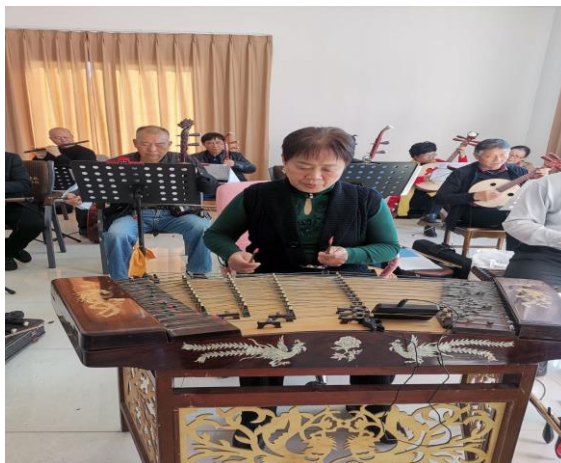
Figure 21. Yangqin accompaniment rehearsal photos