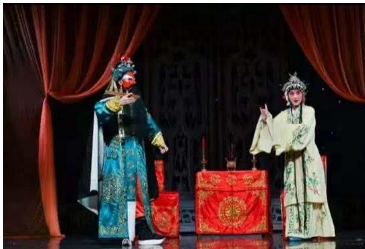
Figure 6. traditional operas of Han Opera in Western Fujian

The yellow tone of Western Fujian Han Opera is rough, simple, and the upper and lower rhyme structure is simple. There are few complicated and gorgeous drag and run tunes. In the early stage, the tone was set to G and a, and some actors even used B. It retains the special color of the singing of "Hongjing" and "Heijing", which is called "five or six Tunes", that is, with La and sol as the melody backbone, as well as the unique singing method of "rain with snow" ("Hongjing" sings with the combination of true and false voice with nasal voice) and fried voice ("Heijing" sings with hoarse voice).