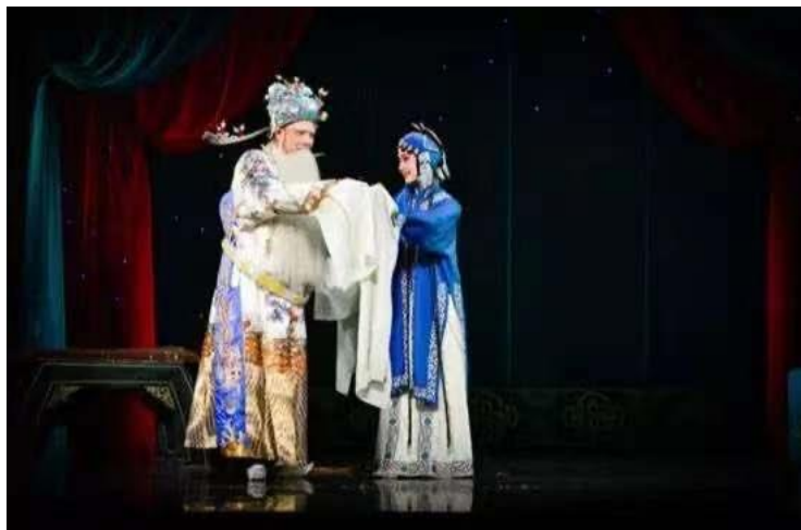
Figure 5. traditional operas of Han Opera in Western Fujian