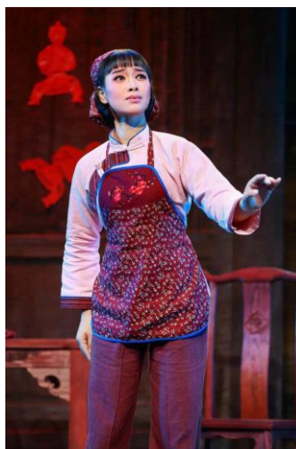
Figure 8. Stills of modern operas of Han Opera in Western Fujian