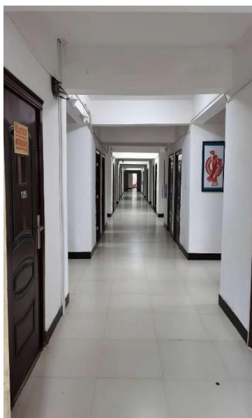
Figure 7 Tongren Preschool Education College Piano Practice Classroom

After the teacher teaches, the students practice on their own, because each student's talent and understanding are different, it is not very conducive to teaching students in accordance with their aptitude. Although the teacher can make inspections, it is still impossible to cover everything. The longer the time, the greater the gap between the students, it is also very difficult for teachers to plan the teaching progress. If the progress is too fast, the students who learn slowly will get tired of learning and gradually give up themselves. If the progress is too slow, students who learn fast will gradually lose motivation and feel that they do not need to go all out to complete the task.