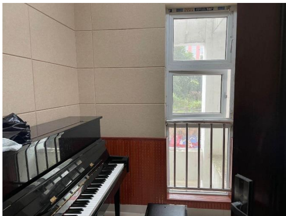
Figure 8 Inside the piano practice classroom

DATE: December 30 2019 Inside the piano practice classroom