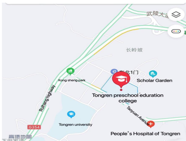
Figure 2 Tongren University Map

http://www.gaode.com >maps DATE:November 6, 2020