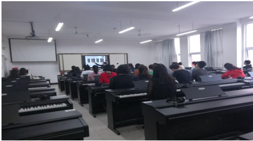
Figure 6 onTongren Preschool Education College Digital piano classroom